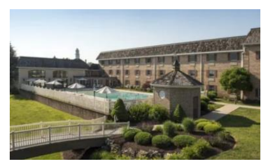
Our <u>Bird-in-Hand Family Inn</u> is open, and check-in has been temporarily relocated to the Pool Building's D Lobby, near the second carport.

When our <u>Bird-in-Hand Stage</u> season opens in April, the shows will go on at our temporary location—3063 Lincoln Highway East.