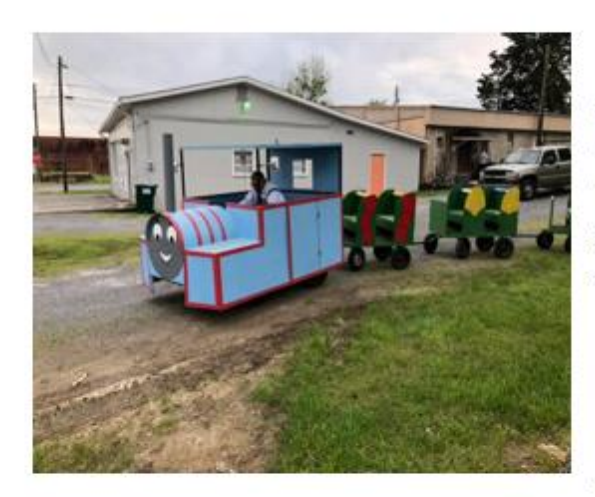
The Depot's very own Big Blue Train will be giving rides. The Depot is the place to be on April 13!

*Operating model trains. Model trains groups from Chattanooga to Atlanta will display operating N, HO, Lionel, and G Scale trains. There will be several trains to ride as well. Many trains will be operating inside and outside the depot (weather permitting)! Kids from 1 to 100 will love the moving trains!