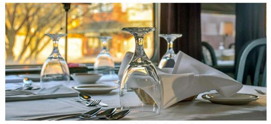
Southern Railway 3158/"Travelers Fare"