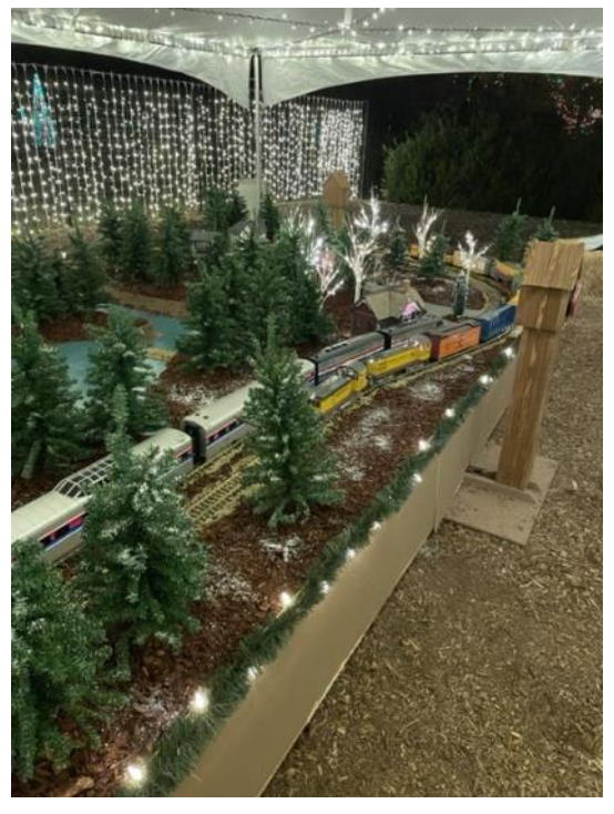
Check out our online store and updated website at www.traininstallations.com

"Since 2001 we have been building the finest quality overhead, garden and tabletop railroads. From children's train tables to museum quality train rooms. Models may be created in your home or business environment in any scale. Making your dreams a reality is our goal."