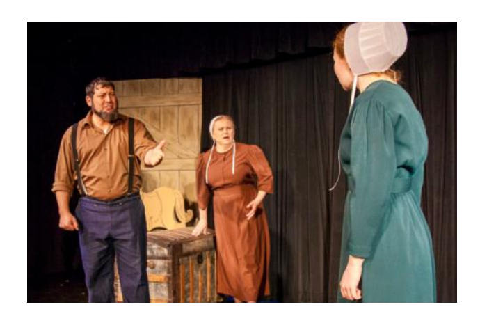
The Confession... An Amish Love Story