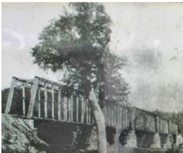
Moingona Bridge 1882 – The Des Moines River bridge she crawled over, Pictured Ca. 1882.