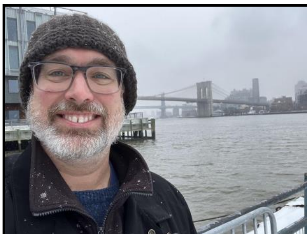
Standing in front of the Brooklyn Bridge

Which is exactly what we've been missing on our journey through The Story . We have found ourselves grinding through reminder after reminder of human cruelty, selfishness, and grasping for power in the Old Testament. We have been waiting - desperately - for God to save us from ourselves. We are ready for Jesus.