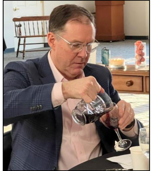
Happenings Around Northbrook during April