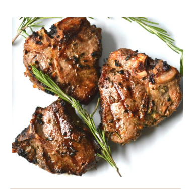
LAMB CHOPS (YOU CAN ALSO USE GRASS FED STEAK)

INGREDIENTS: SALMON FILLETS, ROSEMARY SPRINGS, LEMONS, OLIVE OIL, SALT, BLACK PEPPER, GARLIC, OREGANO AND TURMERIC. SERVE WITH STEAMED BROCCOLI OR CAULIFLOWER AND A SWEET POTATO.