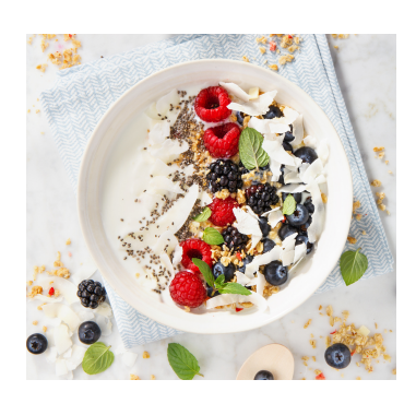
COCONUT MILK YOGURT WITH BERRIES AND POMEGRANATE

INGREDIENTS: EGG WHITES, CHOPPED ASPARAGUS,. BABY SPINACH, GARLIC, AND OREGANO. TOP WITH BROCCOLI SPROUTS.