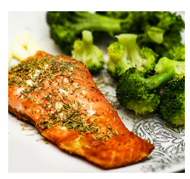
<u>Baked Salmon</u> with Broccoli and Sweet Potato

INGREDIENTS: YELLOW ONION, BUTTERNUT SQUASH, SWEET POTATOES, APPLE, GROUND CINNAMON, NUTMEG, SALT, PEPPER, AND BONE BROTH. SERVE WITH A SIDE SALAD ARUGULA, ROASTED BEETS, SHREDDED CARROTS, AND OLIVE OIL.