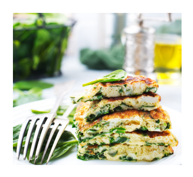
SPINACH AND MUSHROOM, EGG WHITE OMELETTE

INGREDIENTS: COCONUT MILK YOGURT, SLICED KIWI, FLAXSEED (OR SEEDS FROM SEED CYCLING).