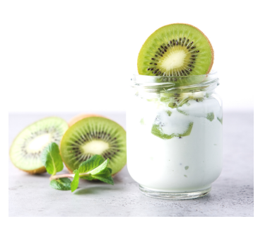
KIWI COCONUT MILK YOGURT

INGREDIENTS: AVOCADO, CUCUMBER, APPLE, KALE, VANILLA PROTEIN POWDER, MCT OIL (OR COCONUT OIL).