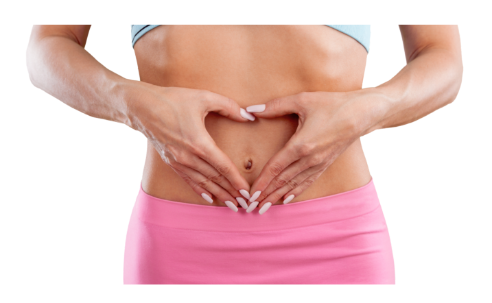
Step 3: Reinoculate

Support the liver and bring in gut repairing foods and supplements. Drink lots of water and eat plenty of fiber to clear out toxic build up.