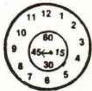
15 Seconds Late 15 Points Lost

In emergency check scoring ALWAYS develop the score from the 30 SECOND mark of the RIDER'S DUE MINUTE.