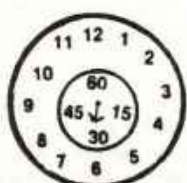
Perfect Time 0 Points Lost