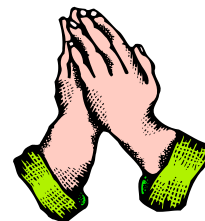
Need a prayer?

Thank you to everyone who gave towards the purchase of study Bibles. To date 62 Bibles have been purchased to be used by our adults or given to our confirmation youth, and youth leaders. The teens who received Bibles were very excited to begin marking and learning.