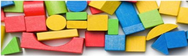
Sunday School Schedule

9:15-9:30 a.m.: Gathering Time in the pre-school room 9:30- 9:45 a.m.: Large Group Worship 9:45-10:20 a.m.: Kids break into age-appropriate classes 10:20-10:30 a.m.: Snack time