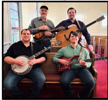
First Go 'Round Band

Neighbors Helping Neighbors is the local organization that will be "In the Spotlight."