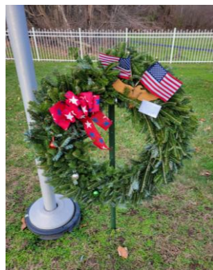
Top Row: Middle Ridge Cemetery , wreaths were staged before the ceremony, then placed on graves; large wreath at base of flag pole. Bottom Row: Kendeigh Cemetery , wreaths were staged before the ceremony; large wreath at base of flag pole; wreaths and flags placed on graves.