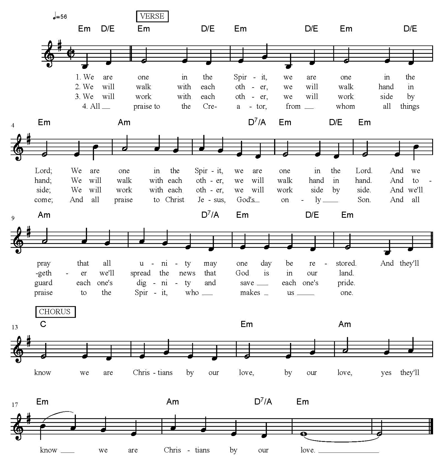
CCLI Song # 26997 © Words: 1966 F.E.L. Publications. Assigned 1991 The Lorenz Corporation |Music: 1966 F.E.L. Publications. Assigned 1991 The Lorenz Corporation For use solely with the SongSelect®. Terms of Use. All rights reserved. www.ccli.com CCLI License # 20388019