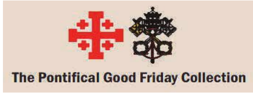
The Pontifical Good Friday Collection

Regina Caeli is accepting applications for student enrollment for PK3-12th grades! Apply today at www.rcahybrid.org