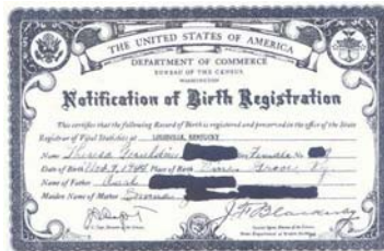
Note: issued by the Dept of Commerce

The Criminal Process usually begins with a Police Officer issuing a Citation [or] making an arrest with or without a Warrant [or] the Police Officer [or] County Attorney prepares a complaint based upon a sworn affidavit or an information, which is presented to a Judge and a Warrant is then issued. The defendant is subsequently arrested and is brought before a Judge for arraignment.