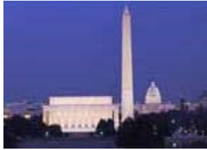
The Washington Monument

The purpose of these pseudo Corporate Courts are only to settle contract disputes and since George Washington's government was military in structure. If either party refuses to participate, these Courts cannot become involved and the dispute is dead in the water! My use of the term "dead in the water" is not a canard because these pseudo Courts are unconstitutional Courts of Admiralty, the International Law of the Sea!