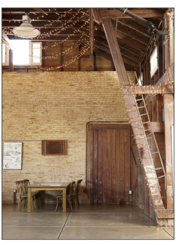
Hay Barn | capacity: Seated: 85 Cocktail Style: 100