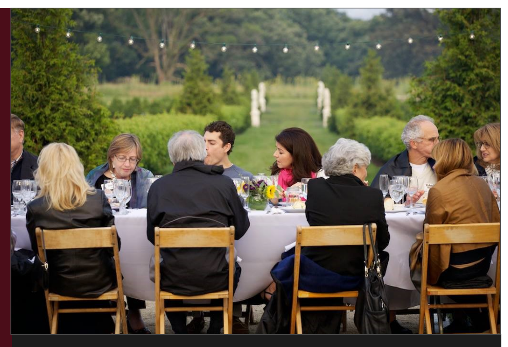
Dining in the Garden at Elawa Farm

Elawa Farm Foundation 1401 Middlefork Drive Lake Forest, Illinois 60045 847.234.1966 www.elawafarm.org