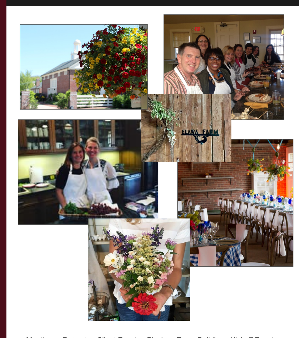
Meetings - Retreats - Client Events - Picnics - Team Building - Kickoff Events