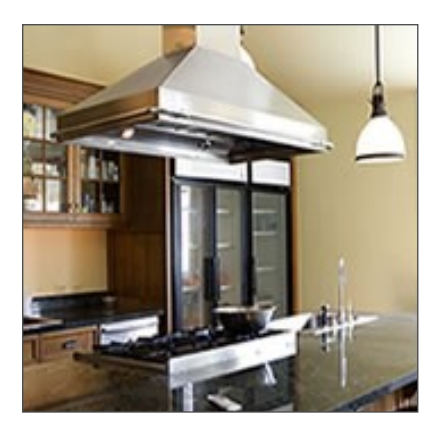
Kitchen | capacity: 20

You may want to book your event on Fridays mornings in season, when our Garden Market it open!