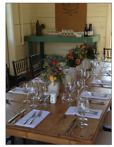
Potting Shed | capacity: 20