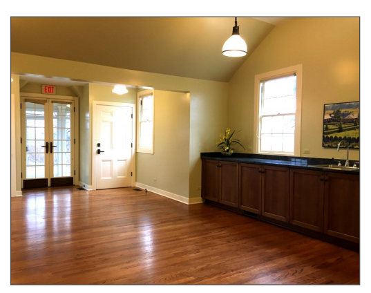
Classroom | capacity: 30