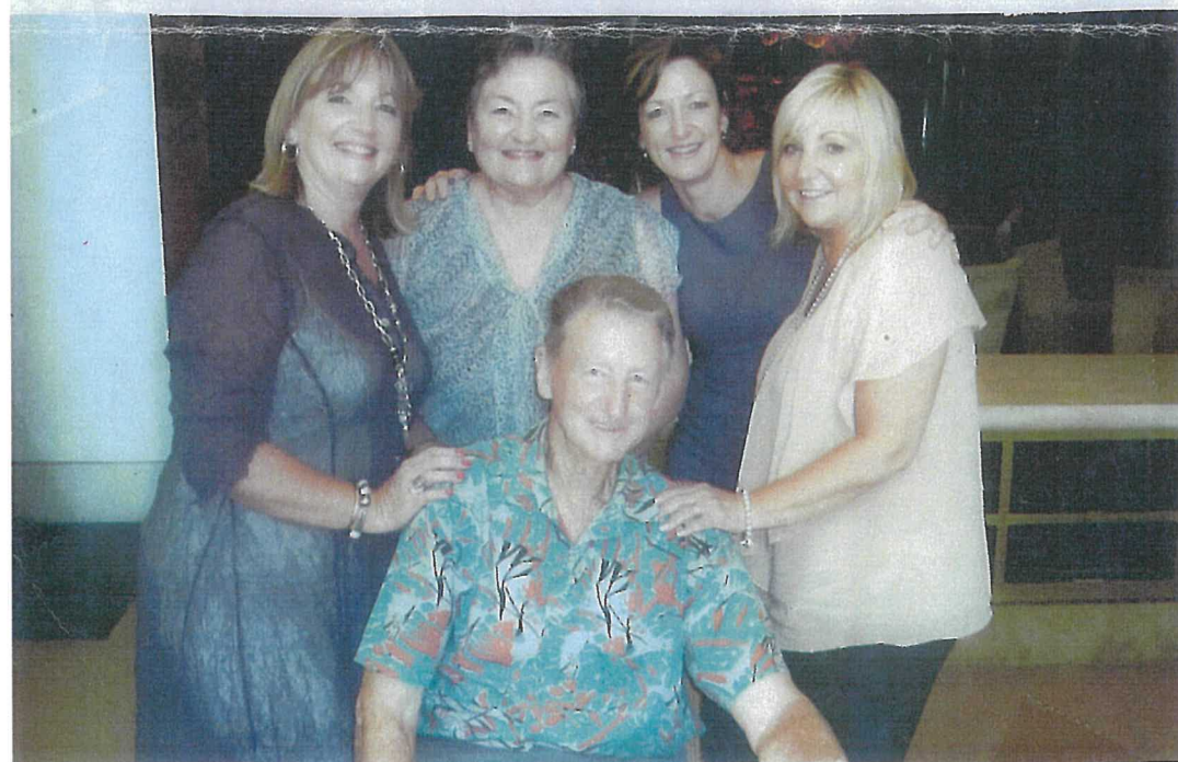
AT JOHN'S 80 th B'kday 22/1/2011.