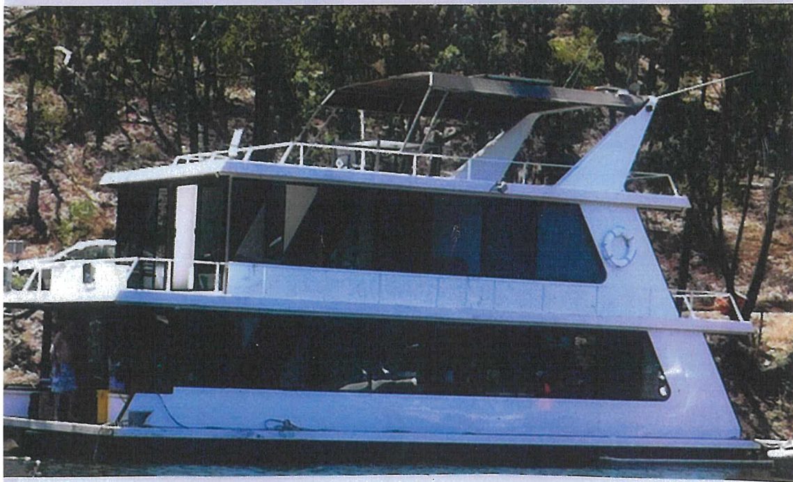
THEIR HOUSE BOAT ON LAKE EILDON