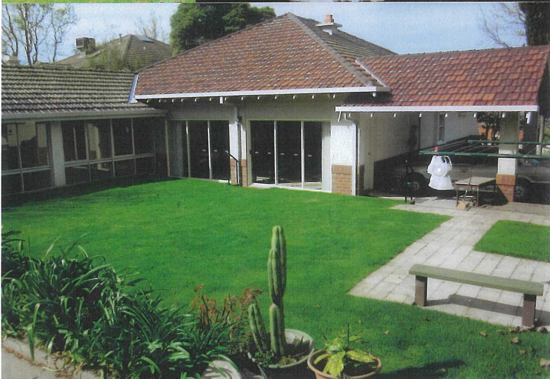
BACK GARDEN OF CANTERBURY HOUSE