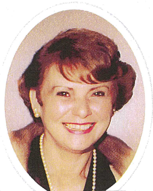
In Loving Memory of