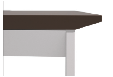
Use of a knife edge lightens the visual scale of a worksurface.