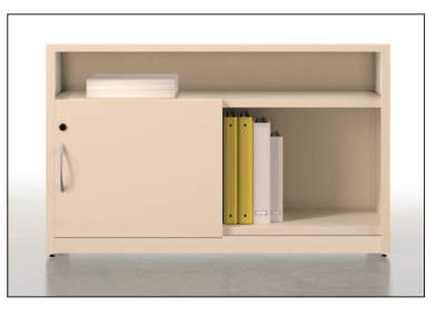
Substitute credenzas for underheads to add more flexible storage.

Unite trim, legs and brackets: Starlight Silver Metallic Unite standard monolithic panel fabric: Pallas Textiles, Freehand in Silhouette Unite worksurfaces: Cherry Storm laminate Unite divider screen: Glass, satin etch one side U-Series side access bookshelf towers and underhead storage: Wet Sand, support leg: Starlight Silver Metallic Impress Ultra with mesh back: Black