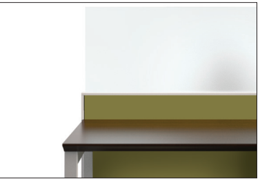
Clear or opaque dividers offer additional space delineation and enhance privacy.