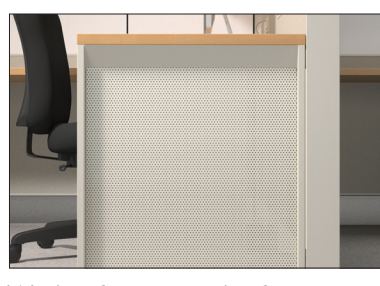
Worksurface supporting frames may be specified with inserts.