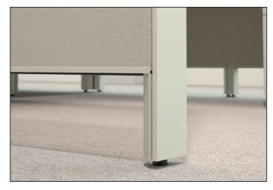
Lighten up a workstation with lifted panels that improve air circulation. Tile-to-floor panels are also available.