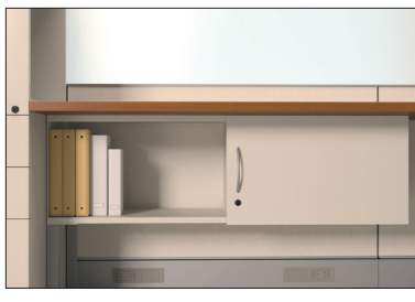
Underheads take advantage of wasted space and provide binder storage for lower panel height stations.