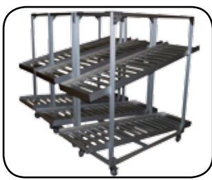
Gravity Flow Racks