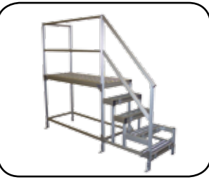
Stairs & Platforms