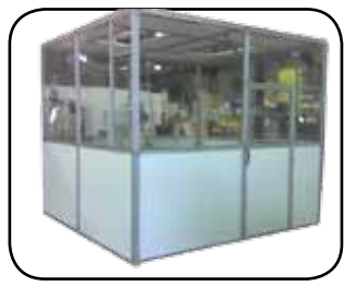
Climate Control Room