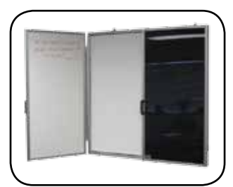
Magnetic Dry Erase Board