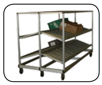
Lean Manufacturing Distributed by: