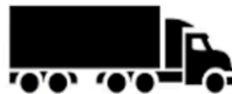
truck stop prostitution