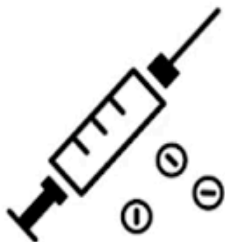
Trade for drugs