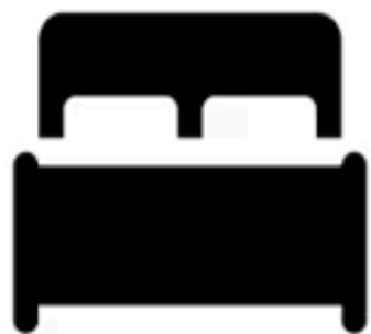
Hotels or motels