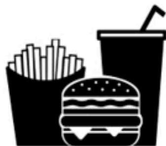
Trade for food