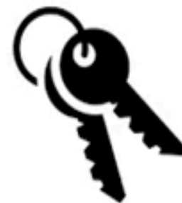
Apartment or house brothels