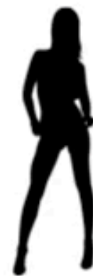
strip club prostitution