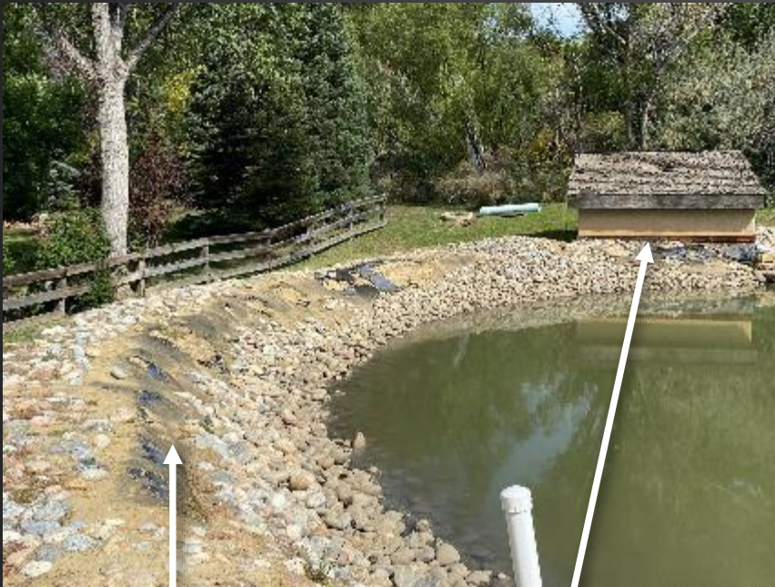
Failing liner – dilapidated pump house

Final cost to SEHOA = ~$88,000, including $3,700 in 2024.