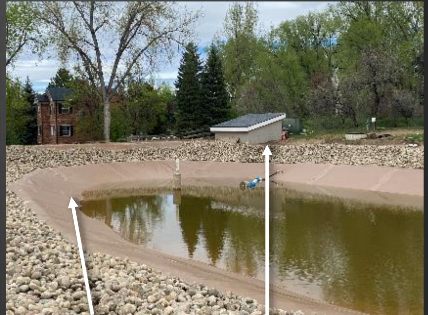
New liner – refurbished pump house