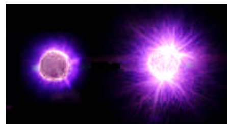
Before embedding After embedding

So what can we learn about scalar enhanced products through Kirlian photos? Well, the absolute most important thing we can learn is that the scalar charge is, unquestionably, embedding itself in the products. Below are just a couple of examples of products before and after embedding.