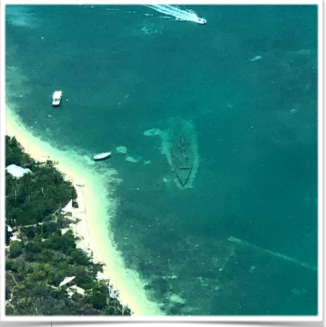
See the ship?