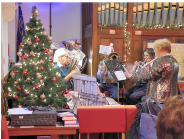
The Over Alderley Band

'As always, a look back to the turn of the year or even before. I am pleased to report our Christmas activities went well, and even the