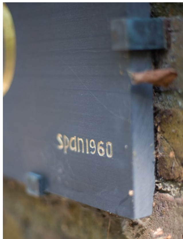
The Fieldend estate was built in 1960-1961 by Span Development Ltd.

4.5 On balance, the Council consider an Article 4(2) Direction is an appropriate measure at Fieldend, which would support the existing systems of control through the residents' management company, and provide a 'safety net' in the event that the current management structure or policies changed in future.