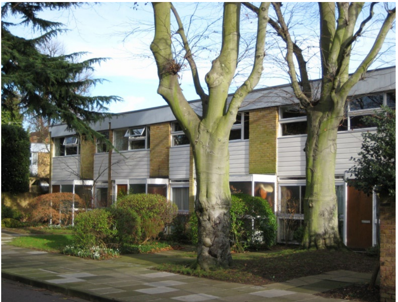
The terraced houses are of a consistent and well detailed modernist design.