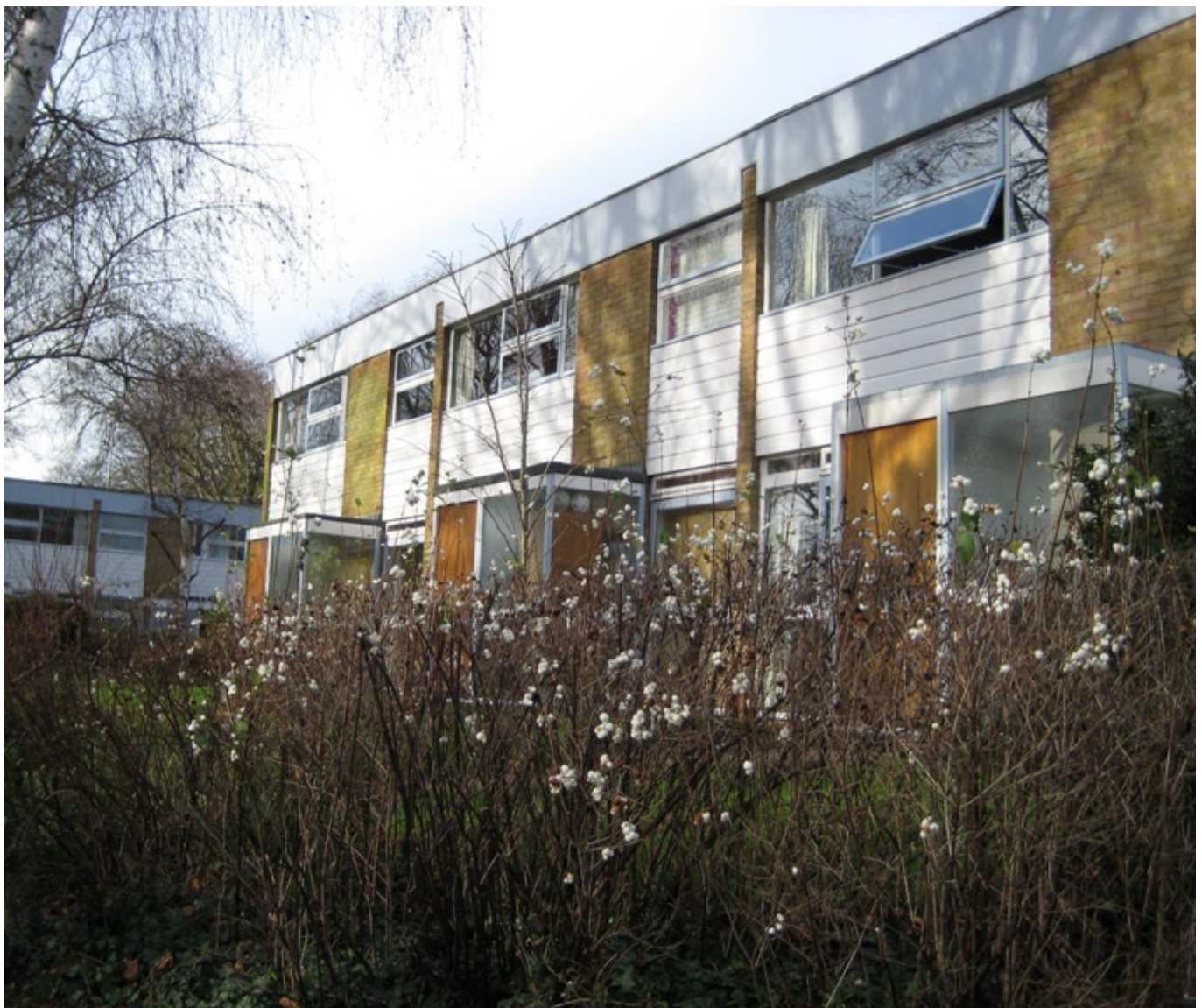
The Fieldend estate is characterised by mature trees and shrubs.