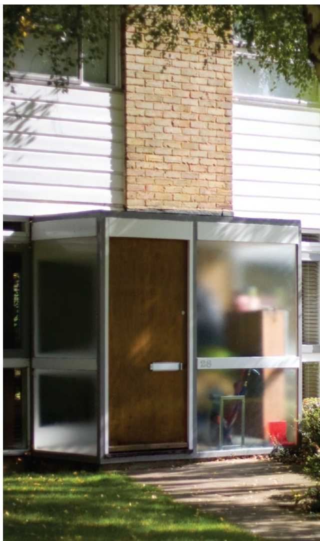
Detail of door/window

4.6 An Article 4(2) Direction covers the following properties: