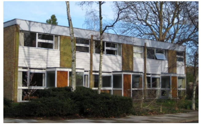
The two storey houses form groups of uniform rectangular buildings.