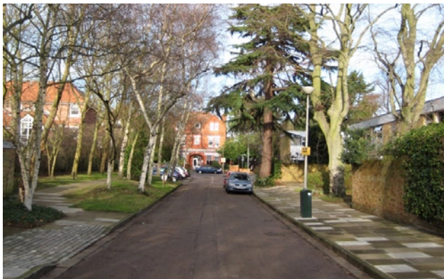
The perimeter road provides a pedestrian environment at the centre of the estate.