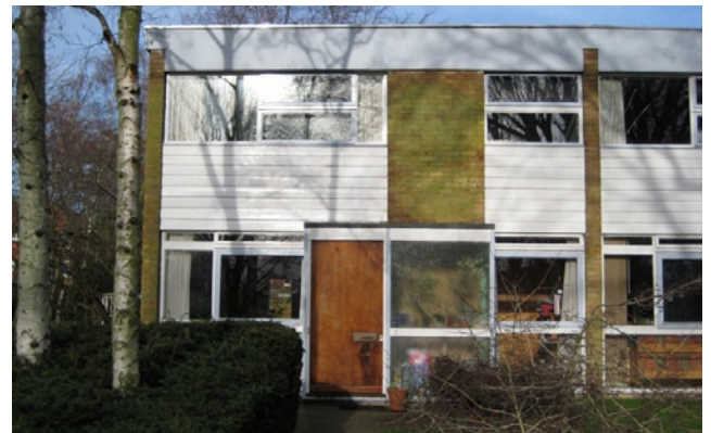
The houses are built of stock brick and have two-tone painted timber windows.