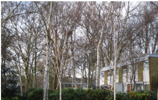
The closely planted groves of birch trees characterise the landscape design.