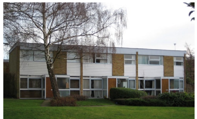
Fieldend is characterised by two communal grass squares.