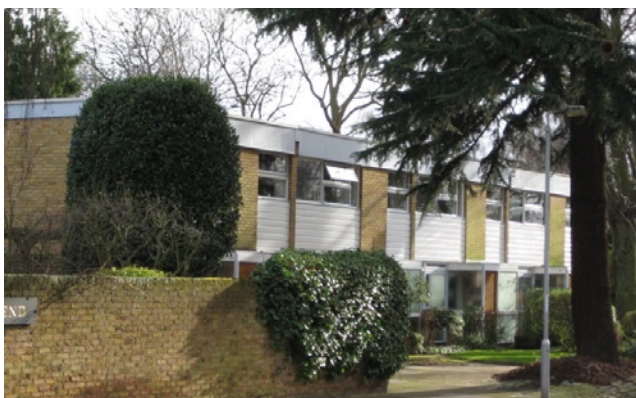
Fieldend is densely planted with a mix of mature trees and shrubs.