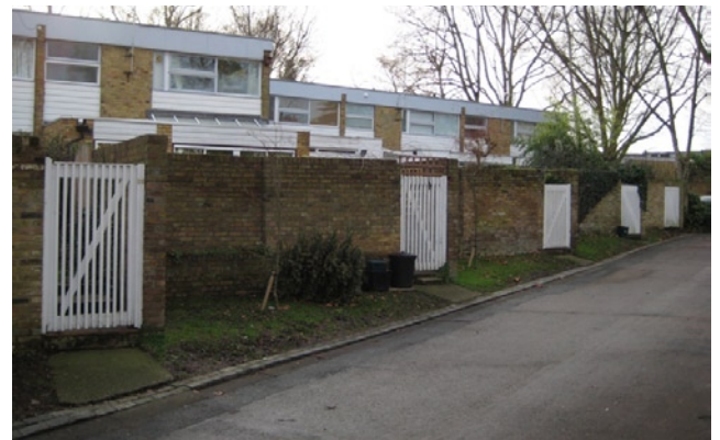
Brick walls with painted timber gates provide the boundary treatment at the rear of houses.