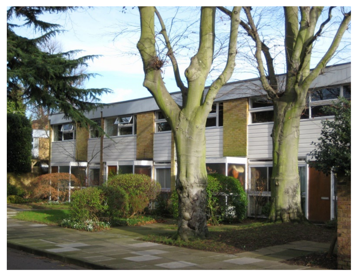
The terraced houses are of a consistent and well detailed modernist design.