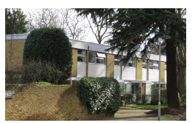
Fieldend is densely planted with a mix of mature trees and shrubs.