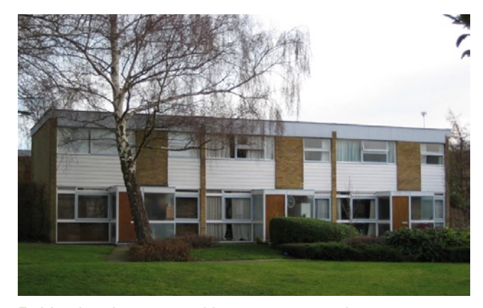
Fieldend is characterised by two communal grass squares.