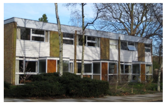
The two storey houses form groups of uniform rectangular buildings.