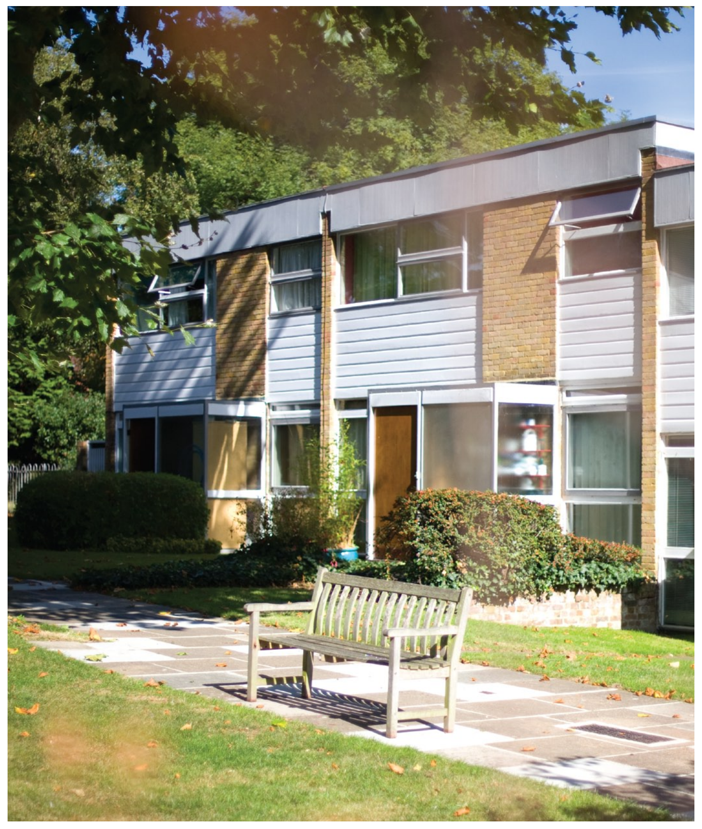
This character appraisal and management plan was adopted by the council on 13th August 2009 following public consultation.