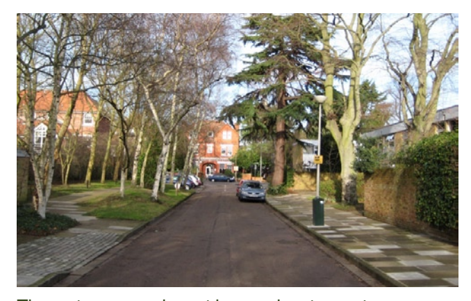
The perimeter road provides a pedestrian environment at the centre of the estate.