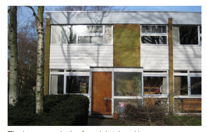
The houses are built of stock brick and have two-tone painted timber windows.