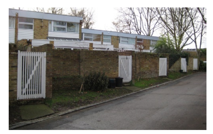
Brick walls with painted timber gates provide the boundary treatment at the rear of houses.