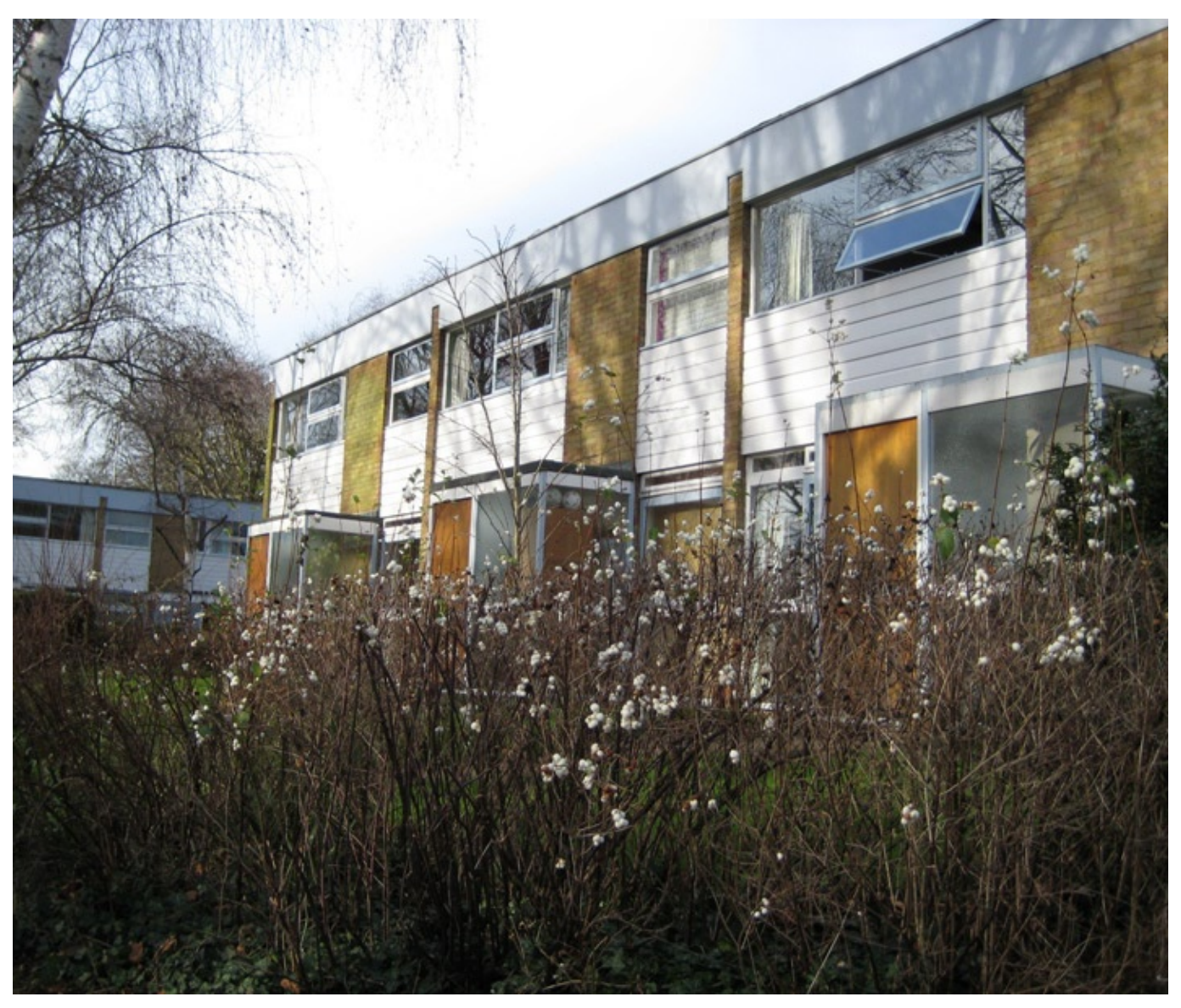
The Fieldend estate is characterised by mature trees and shrubs.