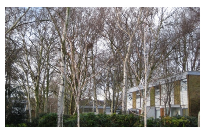
The closely planted groves of birch trees characterise the landscape design.