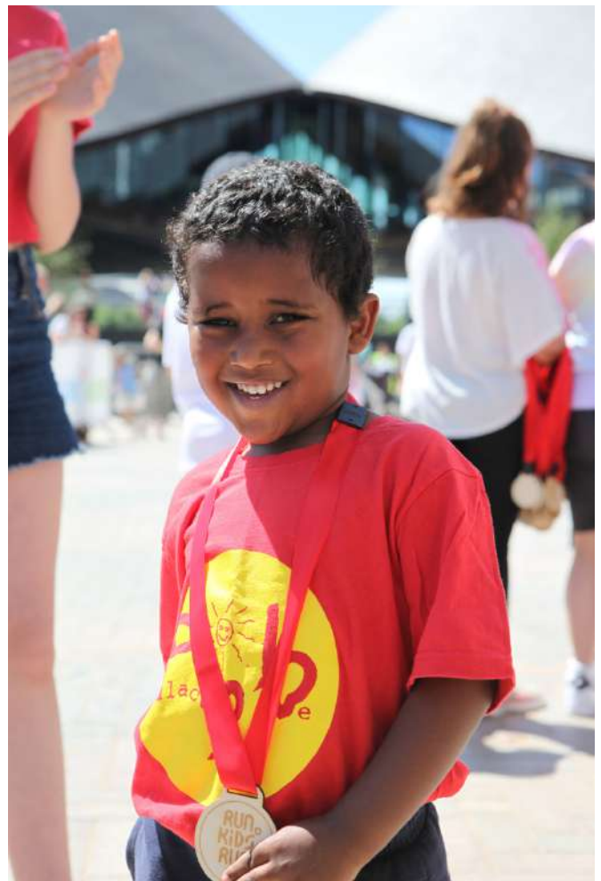
Blessed Sacrament pupils ran with their Place2Be t-shirts.

7 parent sessions Informal chats, 1;1 confidential appointments, space to explore and think. Phone follow-up.