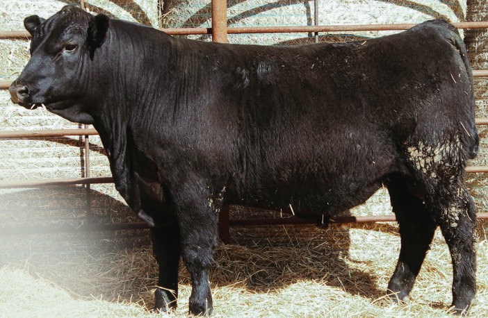
LOT 1 | CS KAWLIGA 3012