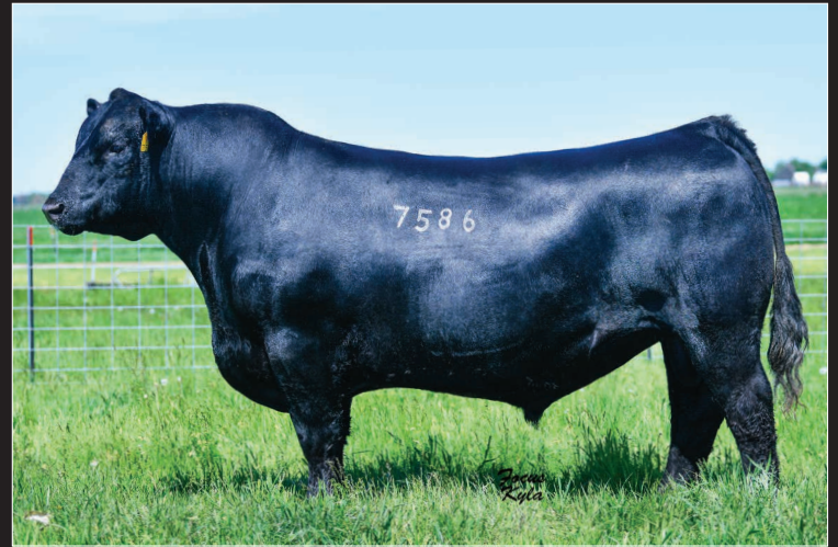
VDAR GALLATIN 7586

Gallatin's daughters are tremendous young cows. Extremely sound footed and correctly made with great attitudes and ideal udders. He's seen a lot of use the last two years and we have a lot of calves on the ground right now. His calves have ratios of 101 on both weaning and yearling. His granddam is a tremendous cow and mother of VDAR Stout 1621. Co-owned with Namminga's, Avon, SD. Semen available.