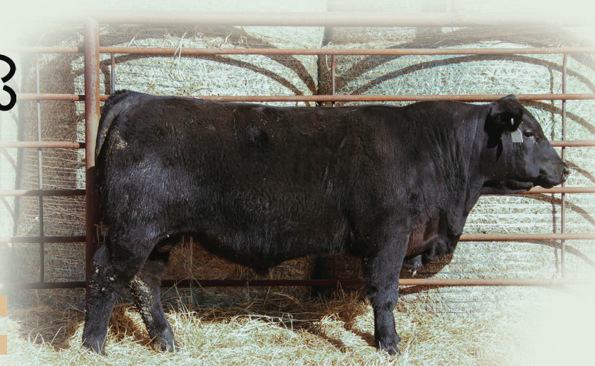
LOT 15 | CS TAHOE 3050