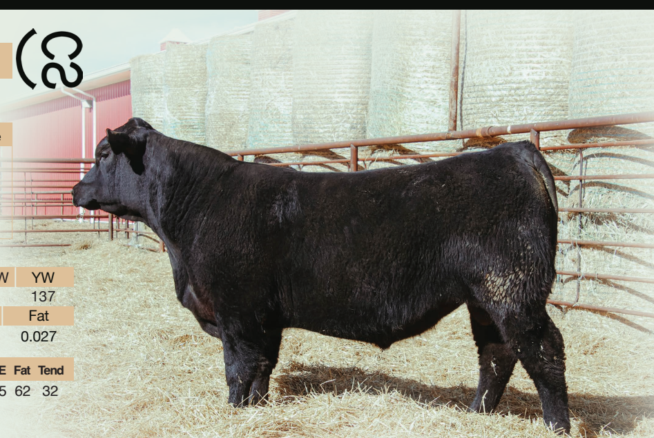
LOT 14 | CS TAHOE 3124