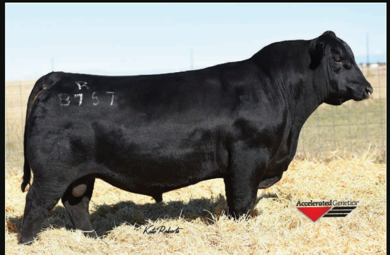
TEHAMA TAHOE B767

Tahoe is a bull we chose to use for his balance of traits. He ranks in the top 1% for calving ease direct, and the top 10% for weaning and yearling weights. He will improve carcass traits, feet and udders. Few sires can match his combination of calving ease, performance, maternal traits and carcass merit all while improving type and longevity.