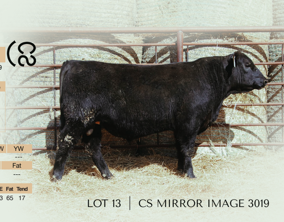
LOT 13 | CS MIRROR IMAGE 3019