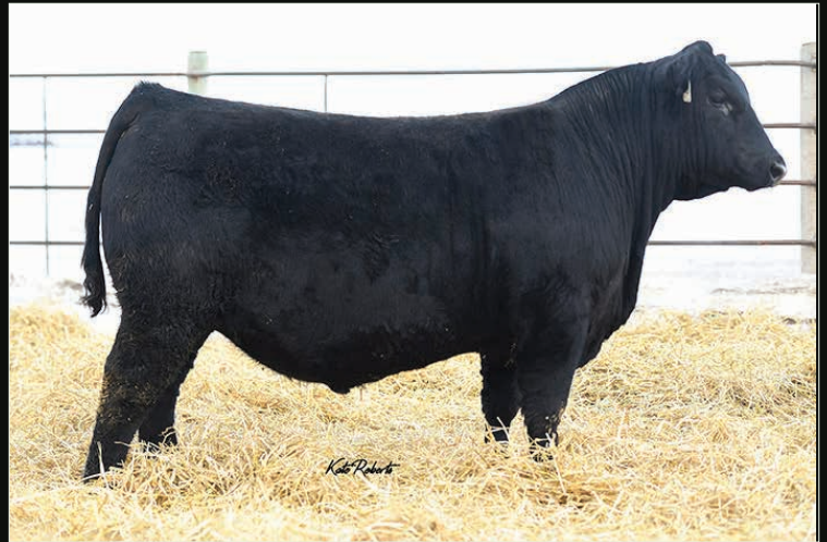
VDAR KAWLIGA 2141

We are very excited to sell our first set of VDAR Kawliga calves this year. He has been one of the most consistent calving ease sires we have ever used. They come extremely easy with a ton of vigor and have tremendous growth in a moderate package from Day 1.