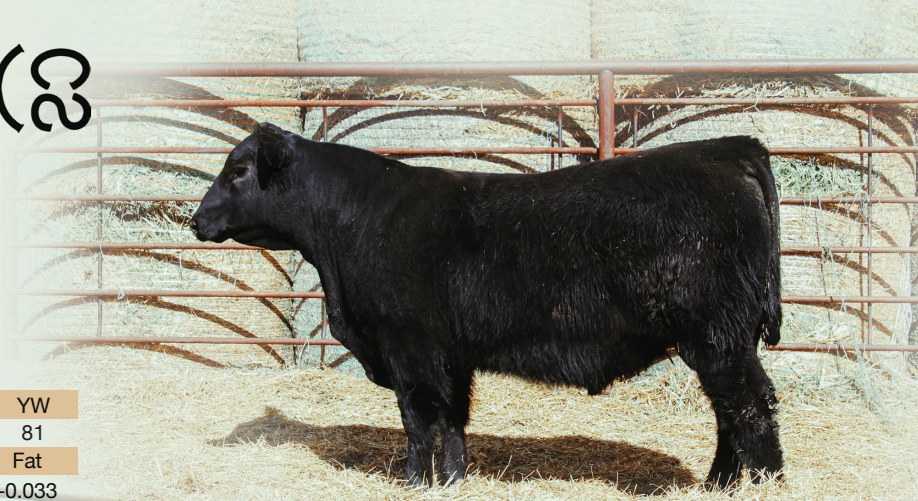
LOT 24 | CS CEDAR WIND 3113