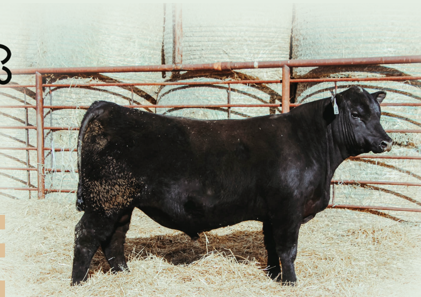
LOT 16 | CS TAHAMA TAHOE 3038