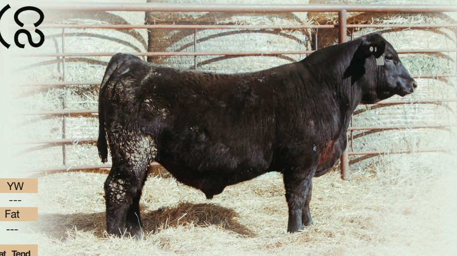
LOT 45 | CS SHOWDOWN 3108