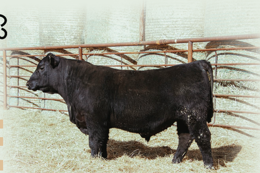
LOT 17 | CS TAHOE 3041