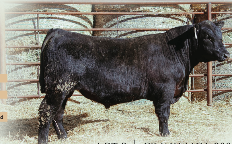
LOT 2 | CS KAWLIGA 3001