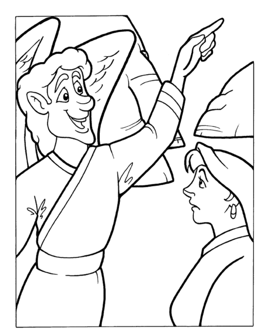
HE IS NOT HERE! HE IS RISEN!