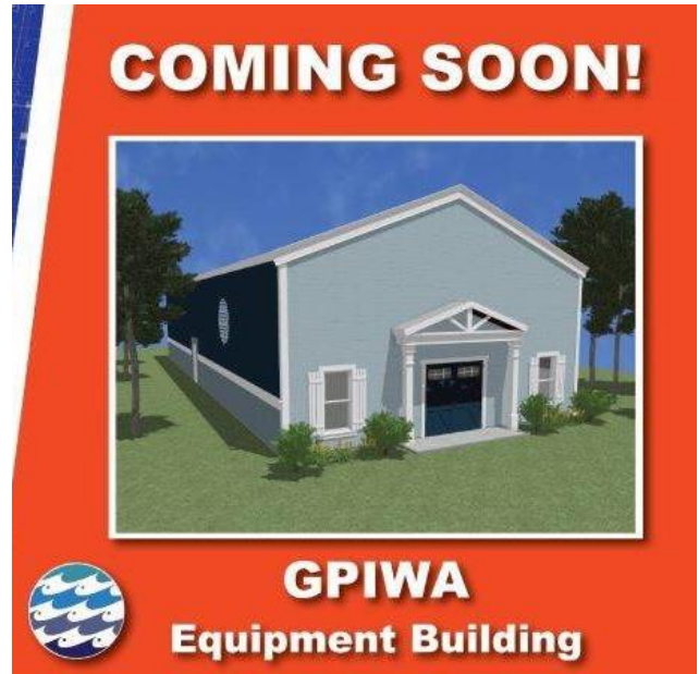
NEW EQUIPMENT BUILDING CURRENTLY UNDER CONSTRUCTION