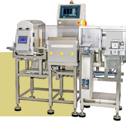
Combi Checker - Combination Of Metal Detector and Checkweigher