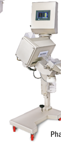
Pharma Metal Detector Metaltrap GX-30