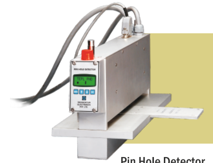
Pin Hole Detector