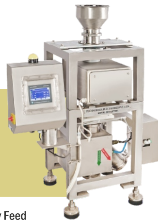
Gravity Feed Metal Detector Metaltrap SS / GX-GF

TEPL is a Leader in Product Checking Systems in India and now spreading their footprint around the globe. Our Metal Detection Systems and Checkweigher Systems meet the GMP norms and most of the International Standards and they have been exported to Europe, South East Asia, Middle East, and African Countries.