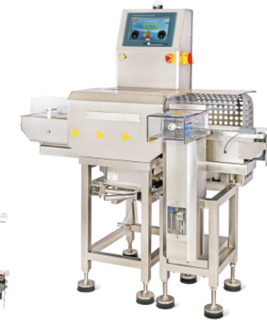
Check Weigher CW 600HSA GX Series