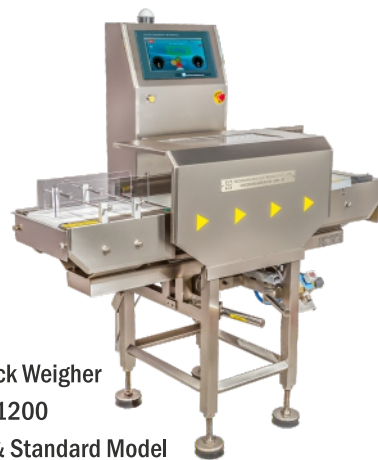
Check Weigher CW 1200 GX & Standard Model