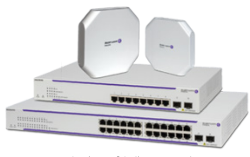
OmniAccess<sup>®</sup> Stellar WLAN and OmniSwitch<sup>®</sup> 2220 WebSmart LAN Switches

User centricity : Easy to connect to, excellent quality and secure user experience for employees and guests.