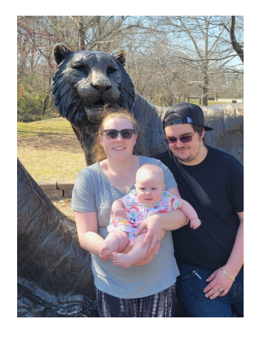
GRANGE DAY AT THE TULSA ZOO MAY 14, 2022