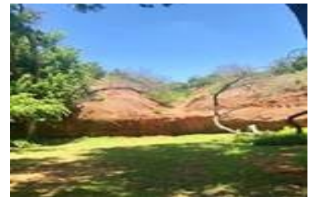
Red Rock Canyon National Park