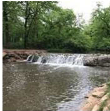
Chickasaw National Park