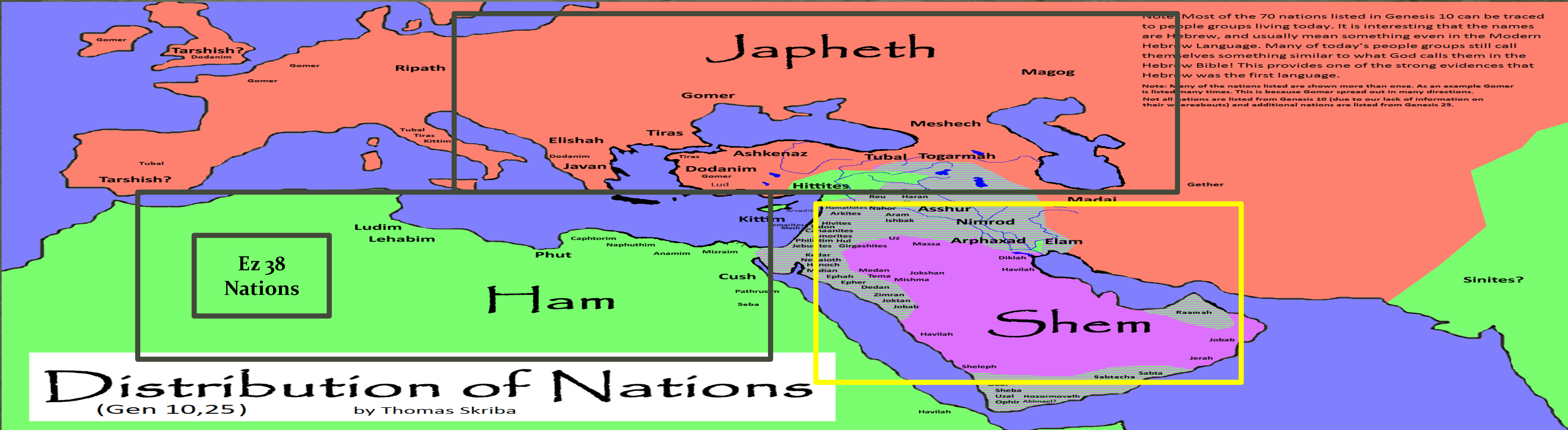
Distribution of Nations (Gen 10,25) by Thomas Skriba