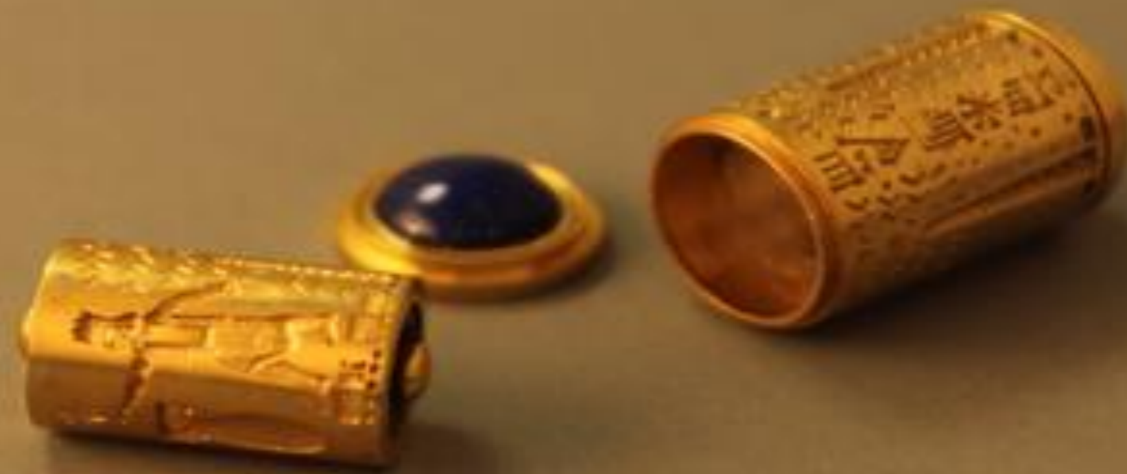
Babylonian cylindrical seal 600BC