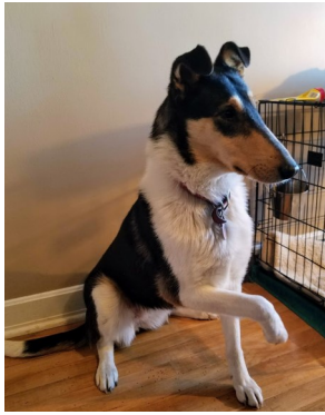
Tira getting her "Lassie" on!