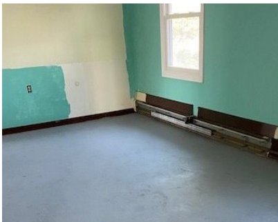
Library Before and...