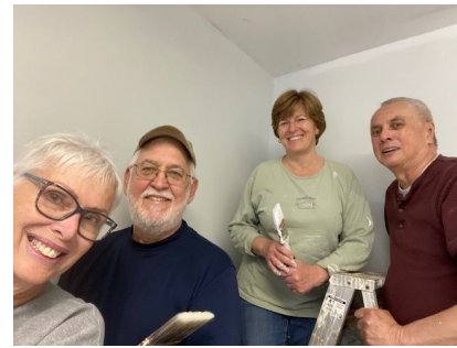
Happy Paint Crew!!!