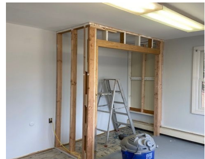
Choir Closet in Progress!!!

Our heartfelt gratitude to those whom have contributed to our renovation!!