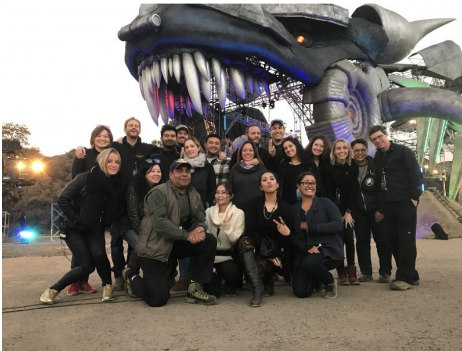
Ultimate Beastmaster group photo.