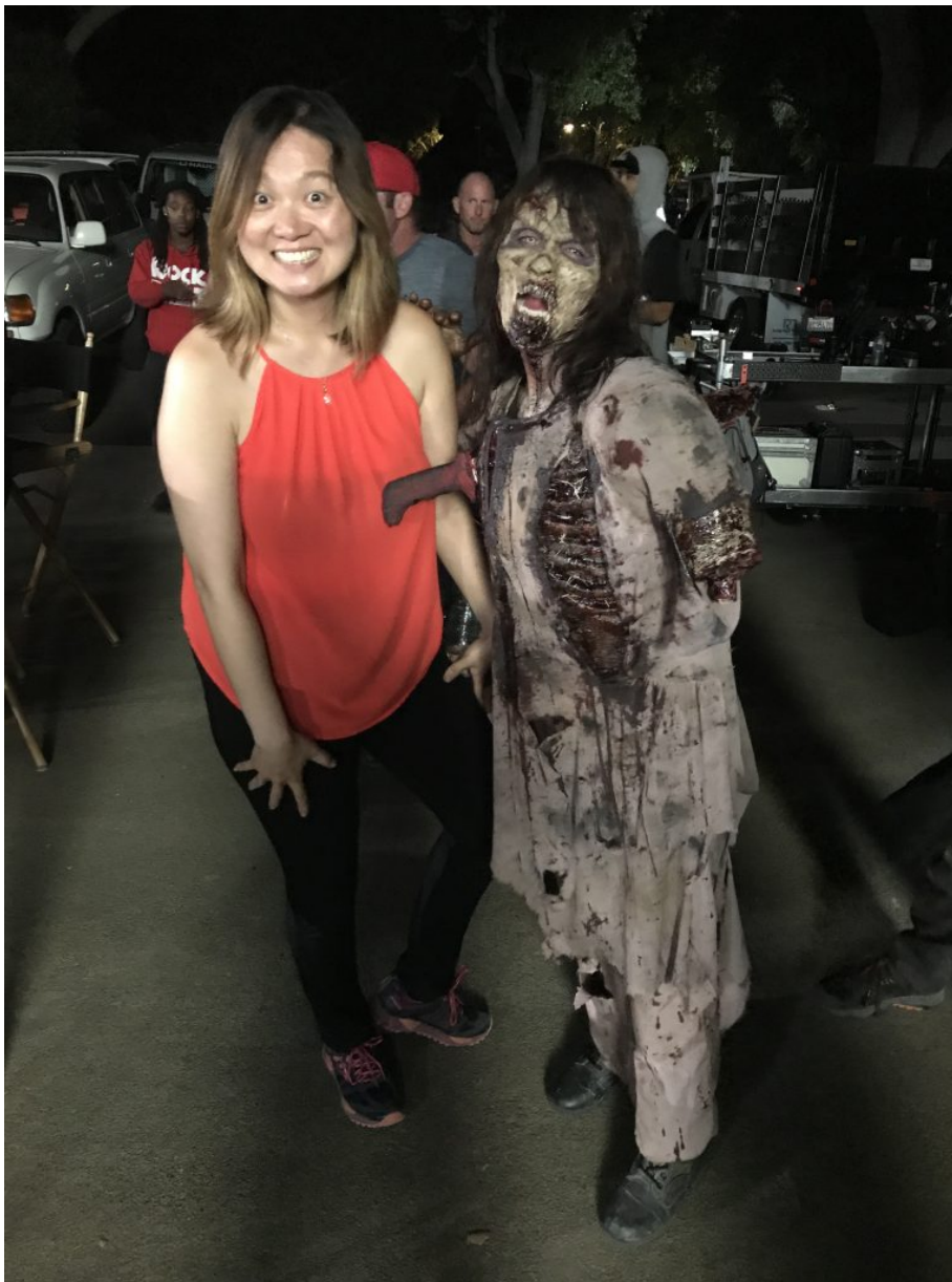
On set of The Walking Dead: Red Machete