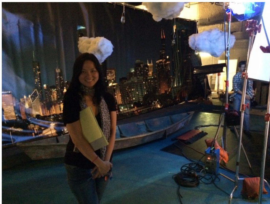
On the set of Lucid State