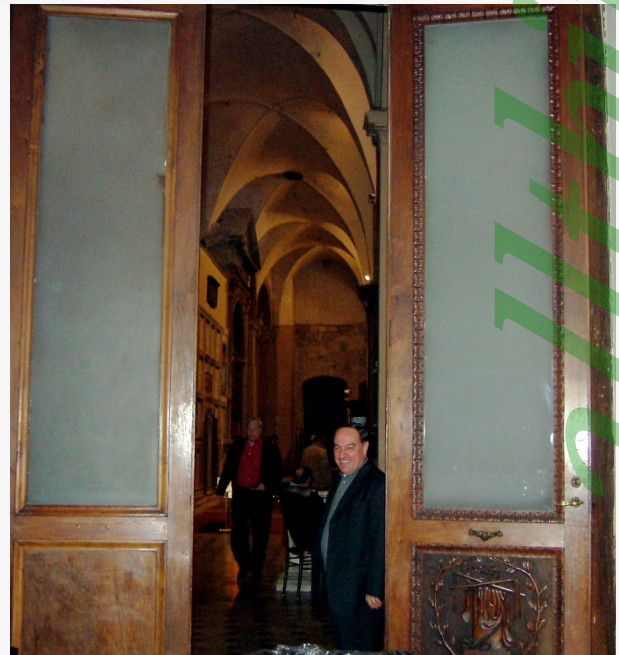
One of the many beautiful Catholic churches we performed in!

We rehearsed for 8 weeks before flying to Northern Italy for a month-long tour. I grew up singing in church and this was my first professional tour! I was going overseas to sing. My temp job even said I could have my spot back after the tour. I'd never been to Europe or anywhere else outside of the U.S and here I was leaving for a month to a country where I didn't speak the language and travelling with people I'd known less than 90 days! But this was my dream and I had to take this chance. I got my passport. Borrowed a friend's digital camera. I added international minutes to my cell phone and promised my mother that I'd call everyday.