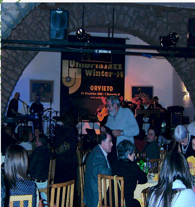
200 year old cafe carved out of the side of a mountain where we performed

I turned on the water and got it to the perfect temperature. As I stepped into the shower, the water suddenly turned scalding hot and in my shock, I turned too quickly to get out of the shower. My wet foot missed the towel on the floor, and needless to say, my wet skin just slipped like an errant ball all over the marble floor. At some point, I banged up against the bathroom door and finally came to a stop when my shoulder hit the toilet. I yelled what I know had to be a few expletives and called on the Lord! Reader I know that's concerning combination! My roommate must have felt that way too because she yanked open the door and asked me if I was okay.