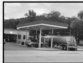
Mobil Gas Pumps