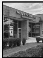
Men's Hair House