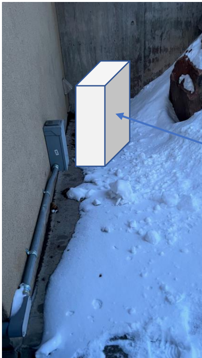
Greyhawk 14 Outside Picture of Heat Pump Location