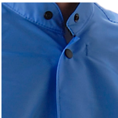
PROTECTION Storm Fly Front