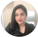
HEAD OF ACADEMICS AT ISCA

We believe in a hands-on approach to learning, providing practitioners with practical experience under guided supervision. Through our state-of-the-art facilities and equipment, students gain invaluable expertise in performing various cosmetic procedures, including injectables, laser treatments, and skin rejuvenation techniques.