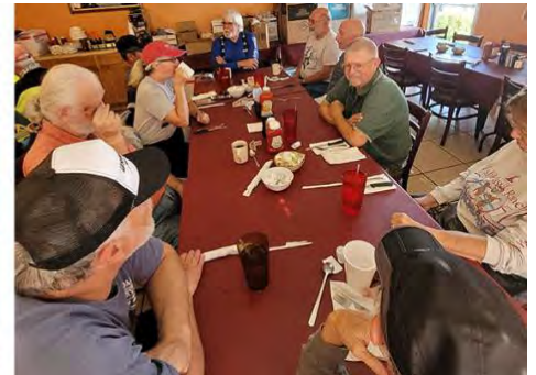
16 Central and Southie riders showed up for a great time at Johnny's Egg Works in Frostproof.