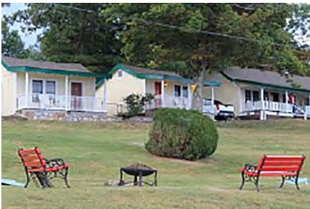
Some of the cottages at Big Lynn Lodge