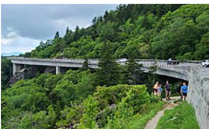
South portion of the Linn Cove Viaduct

On Monday, we drove north on the parkway to Linville Falls and spent most of the morning hiking up to four of the falls' overlooks – great views and what a workout! Felt good.