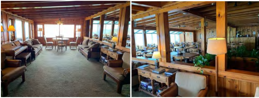
The comfortable lounge and adjacent dining area at the lodge

Seating in the lodge's dining room is assigned by room number. We happened to be next to a couple from Ohio – Bryan and Karen. After conversing at length over three meals, the four of us (along with everyone else) had a very enjoyable Friday evening listening to a local band called “Almost Vintage” and drinking our fill of adult-beverages. They played a variety of rock and country hits from the outdoor