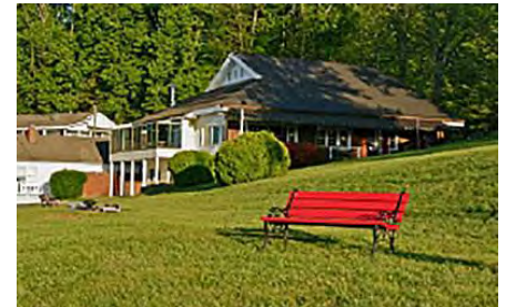
Big Lynn Lodge in Little Switzerland, NC

The Big Lynn Lodge Rally at Little Switzerland in western NC was coming up in mid-July, and Rose was as anxious as I was to get out of the Florida heat and humidity and spend some quality time in the cool mountains. She doesn't ride any more so we decided to trailer the KTM – instead of me riding and her driving.