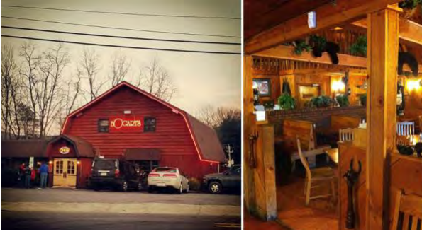
Bogart's Restaurant – Waynesville, NC