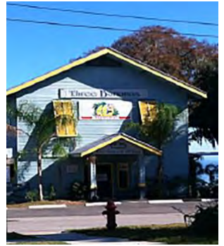
3 Bananas restaurant in Crescent City, FL

When we got back in the car, neither the Audio, the Navigation, the car-activated Phone, the Climate system, the Apps panel nor the Settings menu worked. The center display screen had frozen. I could use my cell manually and some separate temperature controls but not via the touch display nor steering wheel buttons. Mostly, I missed the Nav but had traveled to 3 Bananas enough to remember the way home. So we were OK. Thank goodness it hadn't happened earlier.