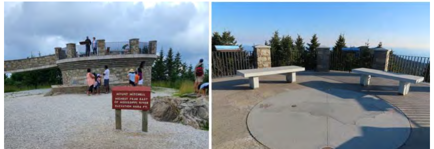
Atop 6684-ft. Mt Mitchell and on the observation deck