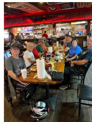
Good crowd, great brunch at the South ride