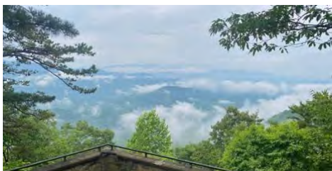
In the clouds on a damp Monday a spectacular overlook