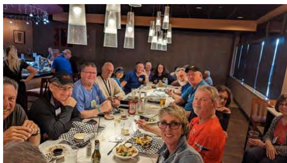
Dinnertime with Floridians et al at STAR '23

And once again, we did beat the rains home. The temps along the coast were up to the low 90's per usual. Hence the justification for the early starts!!