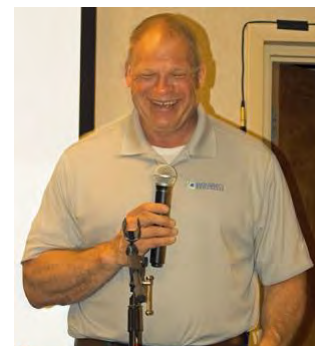
Mayor Glenn Jacobs, aka "Kane" of the WWE, spoke at STAR