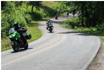
STAR'23 in Knoxville was in the heart of twisty and scenic roads.

If you are a member of the MSTA and have never attended our annual STAR event, you are missing out on one of the best benefits of being a member. The National rally is always located in areas for the best riding in the country. In addition, STAR offers evening seminars, vendors and of course social activities.