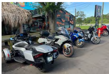
Pretty rides under shady trees at the Wild Turkey Tavern

First, the local info - Our East and West Central rides spanned the State. Catch their reports below. The South Brunch ride covered the middle ground! Buck and I departed at dark-thirty from the 7-11. Predictably, the sun rose behind us as we ventured west, then north. With the temp holding at 80°, we enjoyed our cruise over familiar roads.