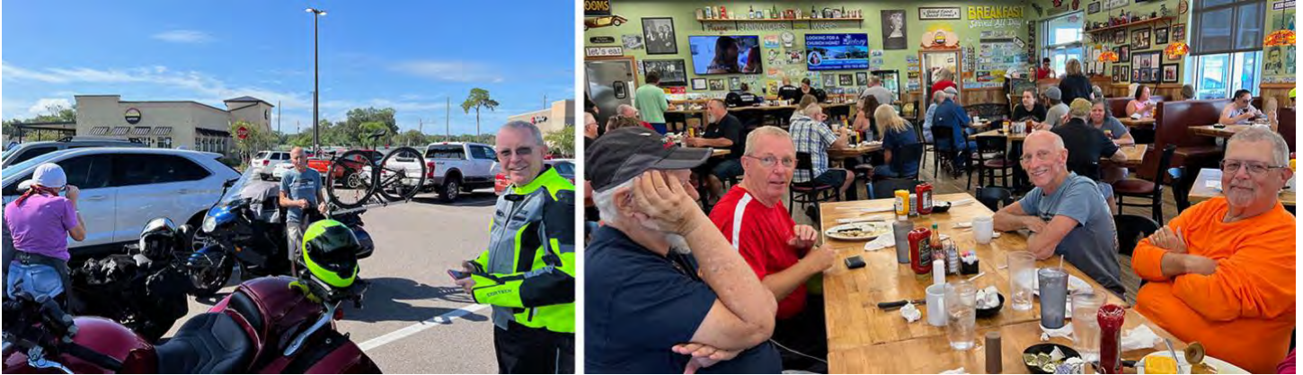
Everyone had a great time talking motorcycles at The Eatery.

Next month, Saturday, August 26 th , it's Roosters Café in Brooksville, so make plans to join us!