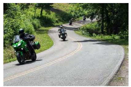
STAR'23 in Knoxville was in the heart of twisty and scenic roads.

If you are a member of the MSTA and have never attended our annual STAR event, you are missing out on one of the best benefits of being a member. The National rally is always located in areas for the best riding in the country. In addition, STAR offers evening seminars, vendors and of course social activities.