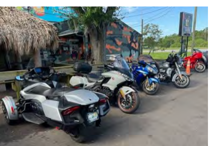
Pretty rides under shady trees at the Wild Turkey Tavern

First, the local info - Our East and West Central rides spanned the State. Catch their reports below. The South Brunch ride covered the middle ground! Buck and I departed at dark-thirty from the 7-11. Predictably, the sun rose behind us as we ventured west, then north. With the temp holding at 80°, we enjoyed our cruise over familiar roads.