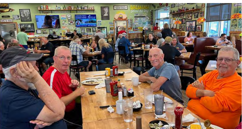
Everyone had a great time talking motorcycles at The Eatery.