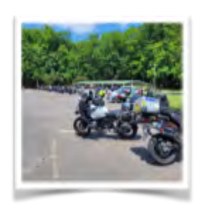
STAR BBQ lunch ride. Roane County Park