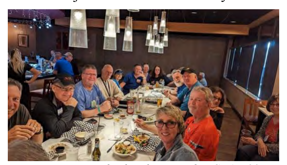
Dinnertime with Floridians et al at STAR'23

And once again, we did beat the rains home. The temps along the coast were up to the low 90's per usual. Hence the justification for the early starts!!