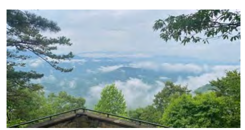
In the clouds on a damp Monday a spectacular overlook

Be there next year!! When you attend, you honor the efforts of nearly 100 volunteers who contribute 1000's of hours for our benefit!! Our requirements for an event hotel often places them at the fringe of great riding areas. The minor "commuting" needed to reach the fun roads is just part of the adventure. The upsides are plenty of rooms, lots of parking, meeting rooms for the terrific seminars and