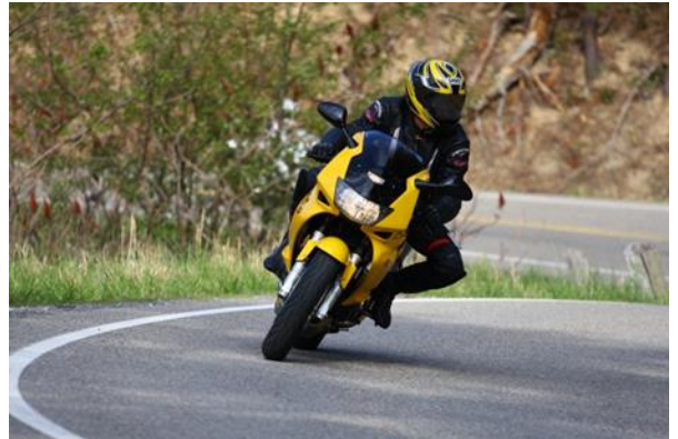
Bike pointed in one direction, rider in another, but both in sync.

See our Mystery Hyperlink for further information on this topic.