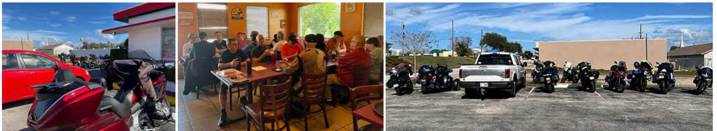
20 riders from all over came out on a beautiful winter's day for the West Central lunch ride to Johnny's Egg House in Frostproof.

The January 2024 West Central Luncheon turnout was spectacular! Approximately 20 riders and passengers from all over the central and southern part of Florida showed up at Johnny's Egg Works in Frostproof. One of our favorite lunch destinations, the restaurant gave us the entire back room of the restaurant, although probably just to keep us out of sight of their regular customers!