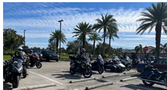
A brisk and sunny South ride through the agra-glades to the Rusty Putter in Ava Maria